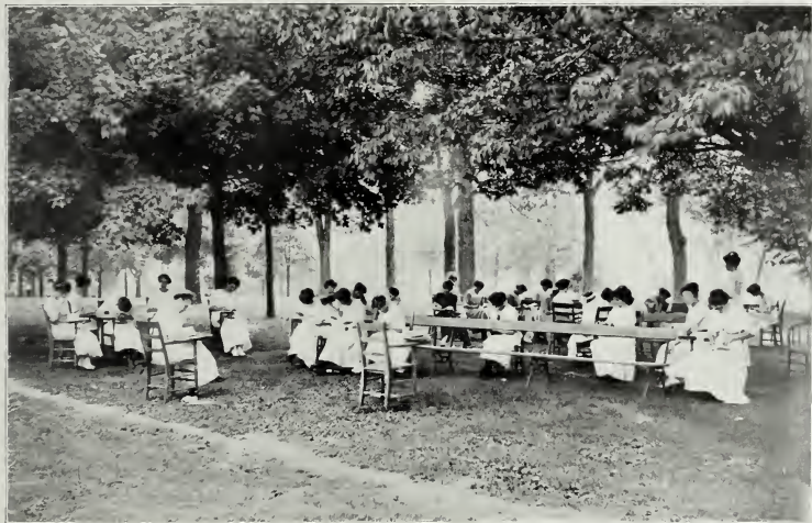
A MIDSUMMER DAY SCENE